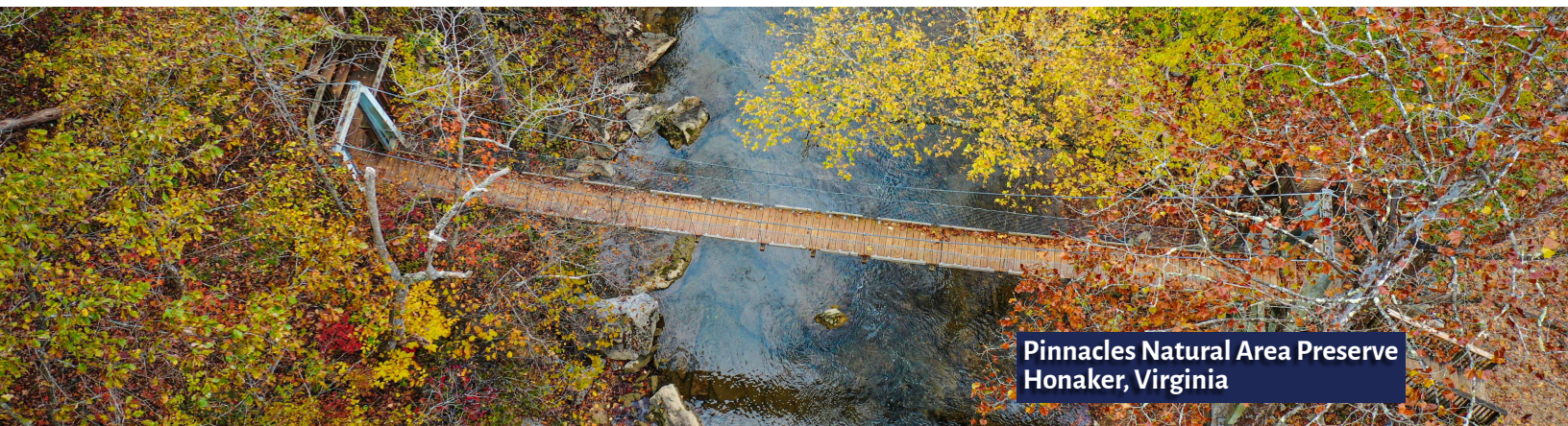
Pinnacles Natural Area Preserve Honaker, Virginia