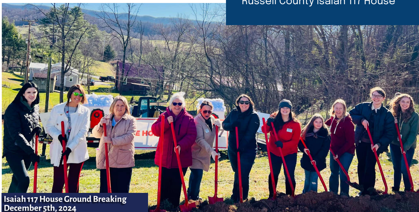
Isaiah 117 House Ground Breaking December 5th, 2024