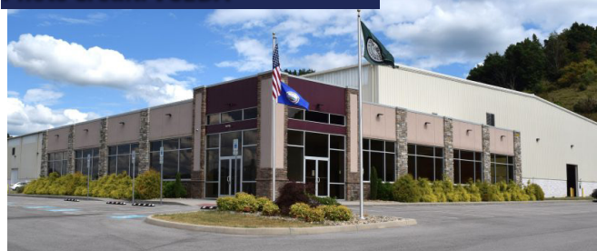
Location of Simmons Equipment Lebanon, Virginia

Through collaboration between Russell County, the Virginia Economic Development Partnership (VEDP), the Russell County Industrial Development Authority (IDA), and Tate Access Floors, Inc., significant progress has been made toward the construction, expansion, equipping, improvement, and operation of Tate's facility. This project involves a capital investment of approximately $14.85 million, with $14.15 million allocated to machinery and tools and $700,000 invested in furniture, fixtures, and business personal property. Additionally, the facility expansion will create and maintain 170 new jobs, offering an average annual salary of $52,020 per full-time position. The resulting economic activity and increased tax revenue from this project demonstrate a strong public benefit, justifying the use of public funds. The Commonwealth's Development Opportunity Fund (COF) grant will be allocated with 10% directed toward Tate's capital investment target and 90% designated for achieving the company's job creation target. This initiative underscores Russell County's commitment to fostering economic growth and enhancing employment opportunities for its residents.