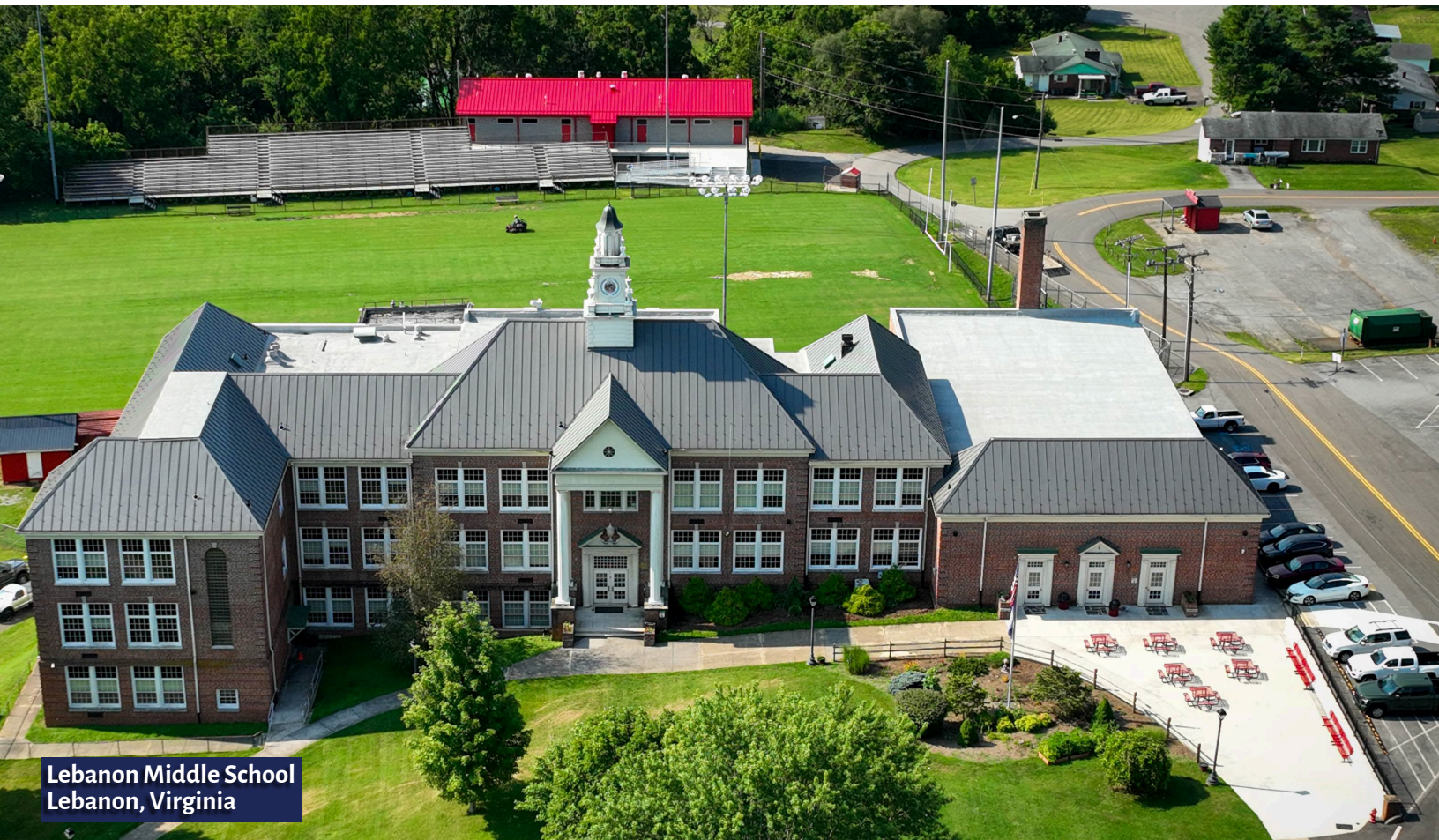
Lebanon Middle School Lebanon, Virginia