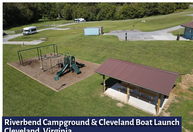
Riverbend Campground & Cleveland Boat Launch Cleveland, Virginia

With use of VDOT Transportation Alternatives funding of $286,000, Dante's historic railroad depot was transformed into a tourist and visitor center, ATV trail-head, and centerpiece for further revitalization