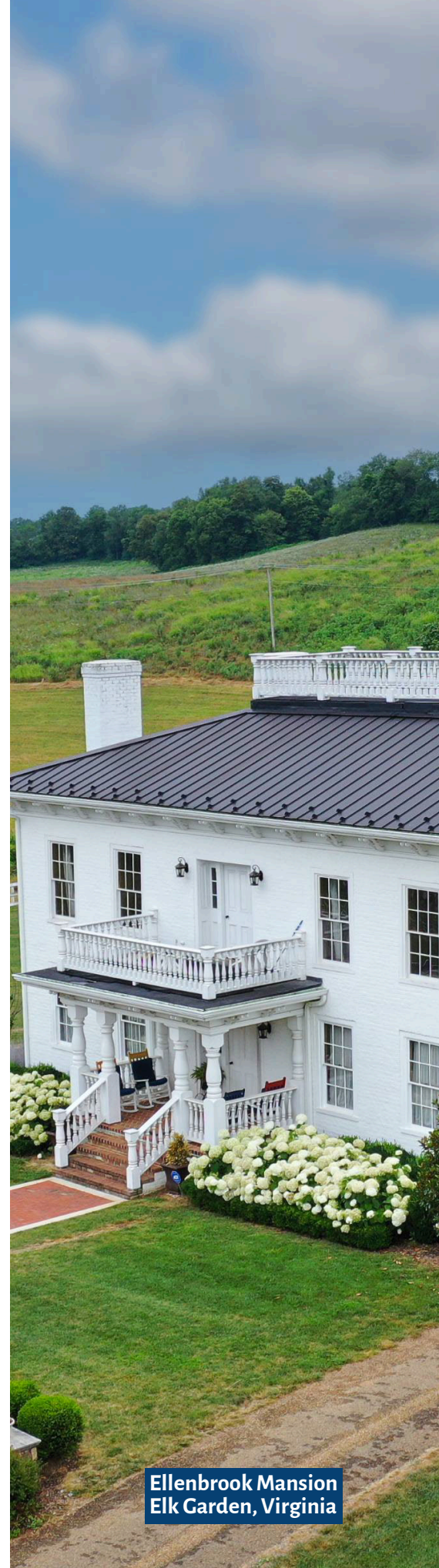
Ellenbrook Mansion Elk Garden, Virginia