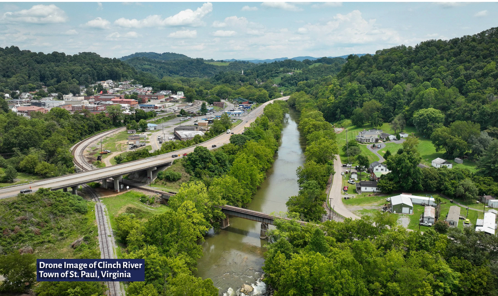
Drone Image of Clinch River Town of St. Paul, Virginia

The project will be servicing a total of 617 individuals and 240 total households. The purpose of the project is to help improve the quality of living conditions of residents living in Dante and Sun communities of Russell County through the provision of new and improved public sewer infrastructure.