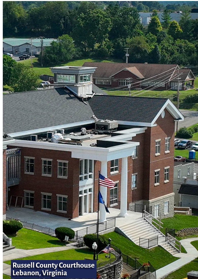
Russell County Courthouse Lebanon, Virginia

Virginia Department of Environmental Quality Litter Grant - $22,430